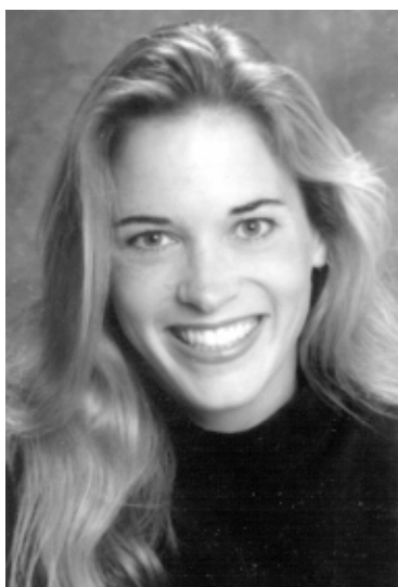
Suzy Favor Hamilton

Hit the road with Suzy to support local kids with cancer!